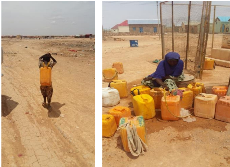
Figure 2. A young girl carrying water on her back (left) and a woman queuing (right).