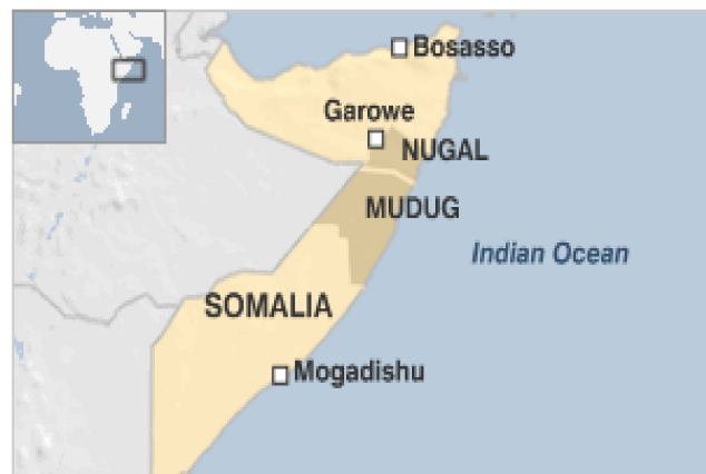
Figure 3. Garowe, Somalia [30].

The weather in Garowe is hot, sunny, and dry from November to February, while it rains in April. Temperatures range from 23 °C in winter, to 41 °C in summer. The average annual rainfall is low, at about 123 mm. Therefore, groundwater is the main source of water supplies for Garowe.